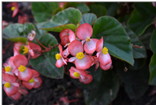
BabyWing Pink Bicolor Begonia flowers

BabyWing Pink Bicolor Begonia is recommended for the following landscape applications;