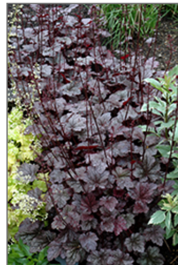
Plum Pudding Coral Bells in bloom