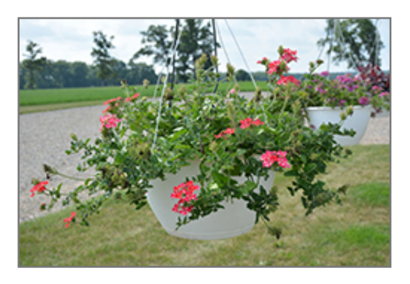
Lanai Synchro Red Star Verbena in bloom

2974 Johnston St., Lafayette, LA 70503 (337) 264-1418 buyallseasons.com