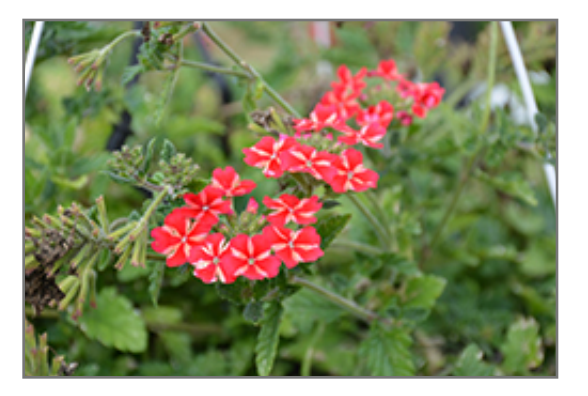
Lanai Synchro Red Star Verbena flowers

Lanai Synchro Red Star Verbena is recommended for the following landscape applications;