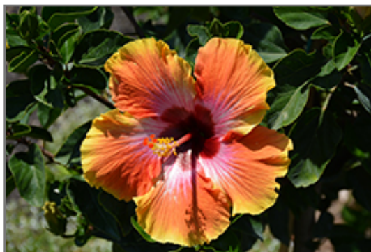
Fiesta Hibiscus flowers

This plant is native to the tropics and prefers growing in moist environments with evenly warm conditions all year round. In our climate, it is usually grown as an outdoor annual in the garden or in a container. If you want it to survive the winter, it can be brought in to the house and provided with special care, and then returned to the garden the following season. In its preferred tropical habitat, as a shrub it can grow to be around 8 feet tall at maturity, with a spread of 6 feet. However, when grown as an annual or when overwintered indoors, it can be expected to perform quite differently, and its exact height and spread will depend on many factors; you may wish to consult with our experts as to how it might perform in your specific application and growing conditions.