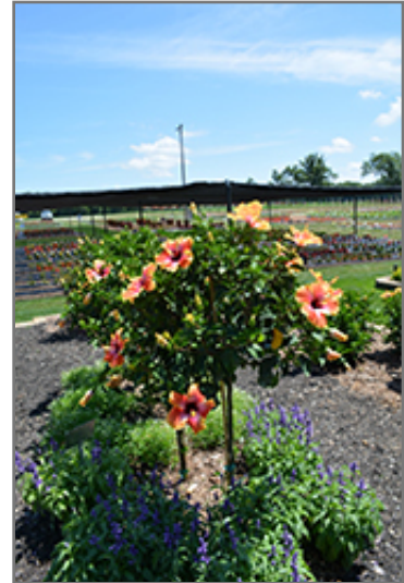
Fiesta Hibiscus (topiary form)

Fiesta Hibiscus makes a fine choice for the outdoor landscape, but it is also well-suited for use in outdoor pots and containers. With its upright habit of growth, it is best suited for use as a 'thriller' in the 'spiller-thriller-filler' container combination; plant it near the center of the pot, surrounded by smaller plants and those that spill over the edges. It is even sizeable enough that it can be grown alone in a suitable container. Note that when grown in a container, it may not perform exactly as indicated on the tag - this is to be expected. Also note that when growing plants in outdoor containers and baskets, they may require more frequent waterings than they would in the yard or garden.