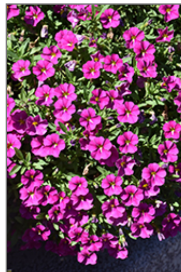
Cabaret Pink Star Calibrachoa flowers

This plant will require occasional maintenance and upkeep. Trim off the flower heads after they fade and die to encourage more blooms late into the season. It is a good choice for attracting bees and hummingbirds to your yard, but is not particularly attractive to deer who tend to leave it alone in favor of tastier treats. It has no significant negative characteristics.