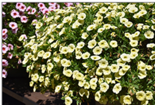
Cabaret Lemon Yellow Calibrachoa flowers

Cabaret Lemon Yellow Calibrachoa will grow to be about 10 inches tall at maturity, with a spread of 18 inches. When grown in masses or used as a bedding plant, individual plants should be spaced approximately 12 inches apart. Its foliage tends to remain low and dense right to the ground. This fast-growing annual will normally live for one full growing season, needing replacement the following year.