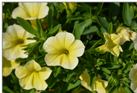
Cabaret Lemon Yellow Calibrachoa flowers