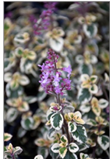
Candy Kisses Wild Sage flowers