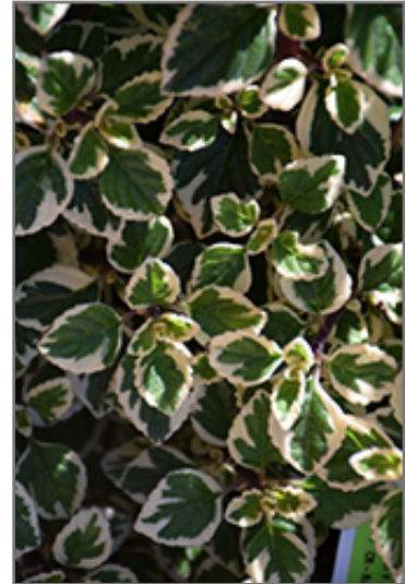
Candy Kisses Wild Sage foliage

This shrub will require occasional maintenance and upkeep. Trim off the flower heads after they fade and die to encourage more blooms late into the season. It is a good choice for attracting bees and butterflies to your yard. It has no significant negative characteristics.