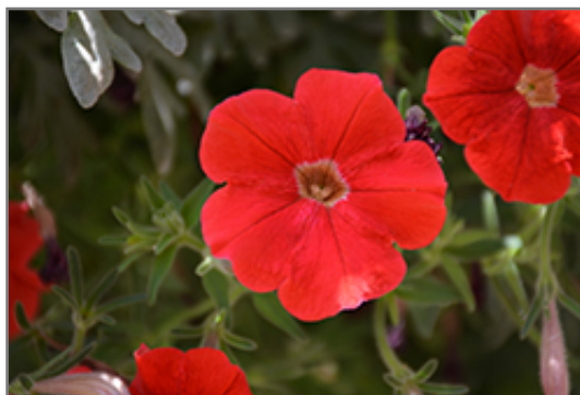
Supertunia Really Red Petunia flowers

This plant will require occasional maintenance and upkeep. Trim off the flower heads after they fade and die to encourage more blooms late into the season. It is a good choice for attracting butterflies and hummingbirds to your yard, but is not particularly attractive to deer who tend to leave it alone in favor of tastier treats. It has no significant negative characteristics.