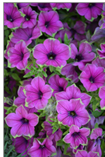
Supertunia Picasso In Purple Petunia flowers