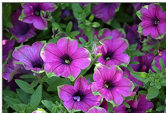
Supertunia Picasso In Purple Petunia flowers

Supertunia Picasso In Purple Petunia is a dense herbaceous annual with a trailing habit of growth, eventually spilling over the edges of hanging baskets and containers. Its medium texture blends into the garden, but can always be balanced by a couple of finer or coarser plants for an effective composition.