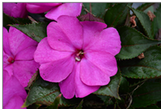
SunPatiens Compact Purple New Guinea Impatiens flowers

This plant will require occasional maintenance and upkeep, and should not require much pruning, except when necessary, such as to remove dieback. It has no significant negative characteristics.