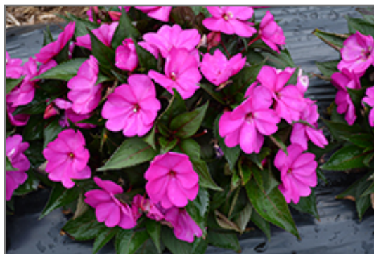
SunPatiens Compact Purple New Guinea Impatiens in bloom

SunPatiens Compact Purple New Guinea Impatiens will grow to be about 24 inches tall at maturity, with a spread of 24 inches. When grown in masses or used as a bedding plant, individual plants should be spaced approximately 20 inches apart. Its foliage tends to remain dense right to the ground, not requiring facer plants in front. This fast-growing annual will normally live for one full growing season, needing replacement the following year.