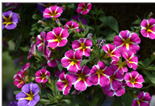
Superbells Rising Star Calibrachoa flowers