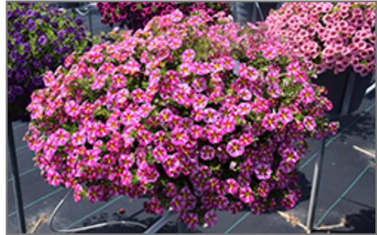
Superbells Rising Star Calibrachoa flowers