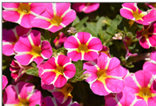
Superbells Rising Star Calibrachoa flowers

Superbells Rising Star Calibrachoa is recommended for the following landscape applications;