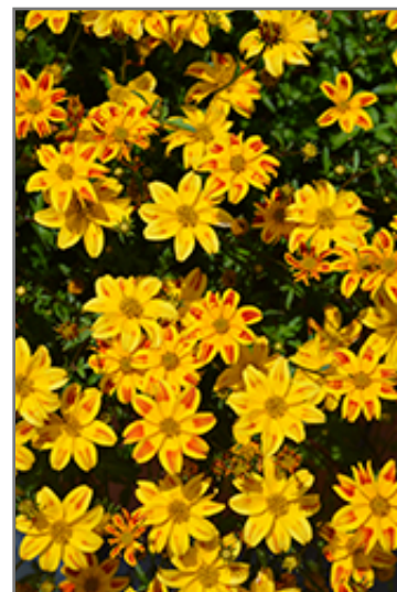
Beedance Red Stripe Bidens flowers

Beedance Red Stripe Bidens is recommended for the following landscape applications;