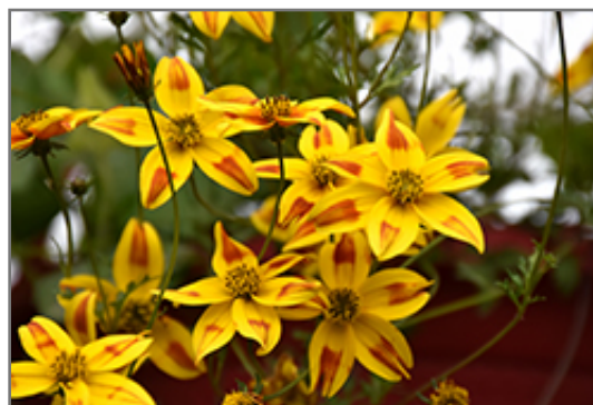
Beedance Red Stripe Bidens flowers