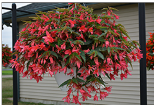
Bossa Nova Pink Glow Begonia in bloom

Bossa Nova Pink Glow Begonia will grow to be about 14 inches tall at maturity, with a spread of 18 inches. When grown in masses or used as a bedding plant, individual plants should be spaced approximately 16 inches apart. Its foliage tends to remain dense right to the ground, not requiring facer plants in front. It grows at a medium rate, and under ideal conditions can be expected to live for approximately 3 years. As an evergreen perennial, this plant will typically keep its form and foliage year-round.