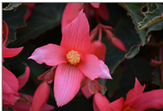
Bossa Nova Pink Glow Begonia flowers