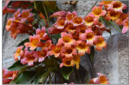
Tangerine Beauty Cross Vine flowers

Tangerine Beauty Cross Vine will grow to be about 30 feet tall at maturity, with a spread of 3 feet. As a climbing vine, it tends to be leggy near the base and should be underplanted with low-growing facer plants. It should be planted near a fence, trellis or other landscape structure where it can be trained to grow upwards on it, or allowed to trail off a retaining wall or slope. It grows at a fast rate, and under ideal conditions can be expected to live for approximately 20 years.