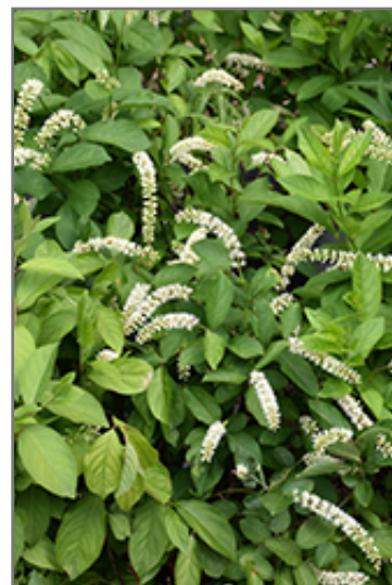
Scentlandia Virginia Sweetspire flowers

Scentlandia Virginia Sweetspire is recommended for the following landscape applications;