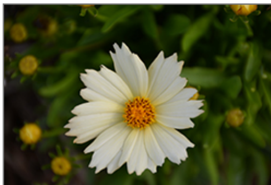
UpTick Cream Tickseed flowers