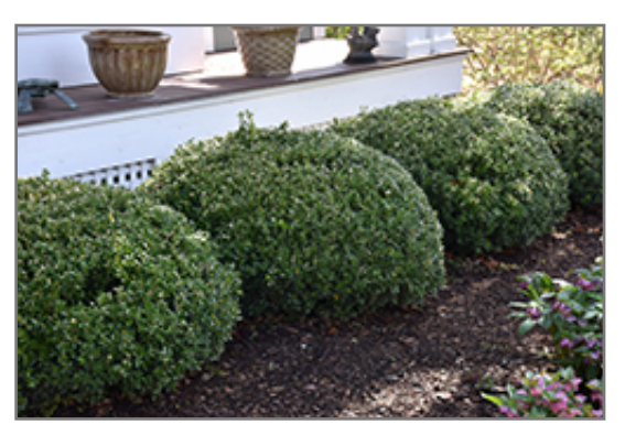
Sprinter Boxwood

This shrub does best in a location that gets morning sunlight but is shaded from the hot afternoon sun, although it will also grow in partial shade. Keep it away from hot, dry locations that receive direct afternoon sun or which get reflected sunlight, such as against the south side of a white wall. It prefers to grow in average to moist conditions, and shouldn't be allowed to dry out. It may require supplemental watering during periods of drought or extended heat. It is not particular as to soil type or pH. It is highly tolerant of urban pollution and will even thrive in inner city environments, and will benefit from being planted in a relatively sheltered location. This is a selected variety of a species not originally from North America.