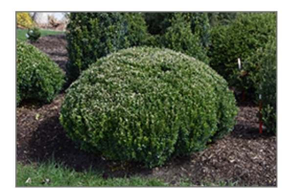
Sprinter Boxwood

Sprinter Boxwood is recommended for the following landscape applications;