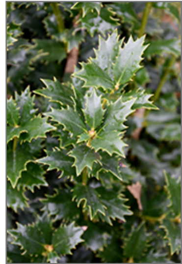
Acadiana Holly foliage