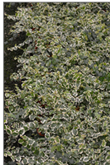
Variegated Creeping Fig in full