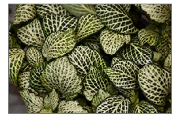
Mosaic Plant foliage

Mosaic Plant's attractive oval leaves remain dark green in color with distinctive white veins and tinges of pink throughout the year on a plant with a spreading habit of growth. It features dainty spikes of white flowers with light green bracts rising above the foliage from mid to early winter.