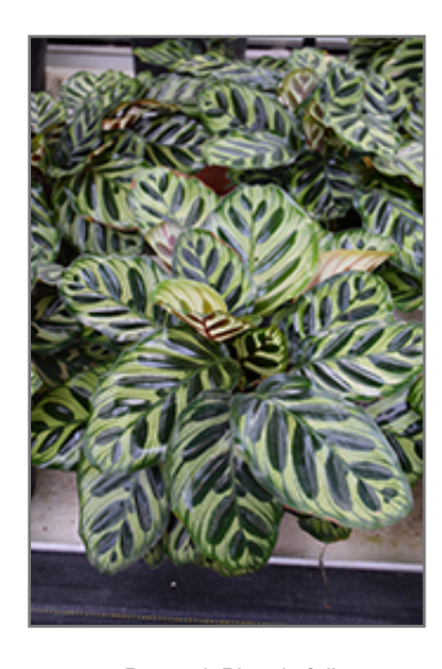
Peacock Plant in full

When grown indoors, Peacock Plant can be expected to grow to be about 24 inches tall at maturity, with a spread of 18 inches. It grows at a slow rate, and under ideal conditions can be expected to live for approximately 5 years. This houseplant should only be grown away from direct sunlight or in a room with strong artificial light. It does best in average to evenly moist soil, but will not tolerate standing water. The surface of the soil shouldn't be allowed to dry out completely, and so you should expect to water this plant once and possibly even twice each week. Be aware that your particular watering schedule may vary depending on its location in the room, the pot size, plant size and other conditions; if in doubt, ask one of our experts in the store for advice. It is not particular as to soil pH, but grows best in rich soil. Contact the store for specific recommendations on pre-mixed potting soil for this plant.