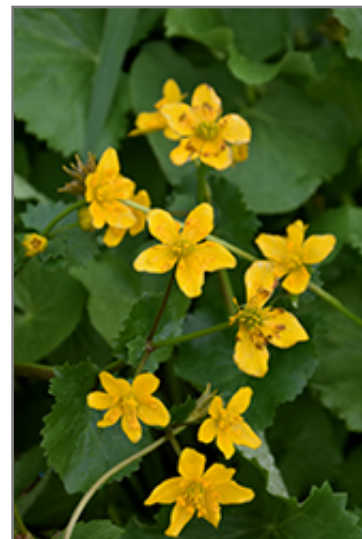
Marsh Marigold flowers