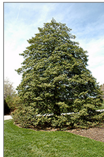
American Holly