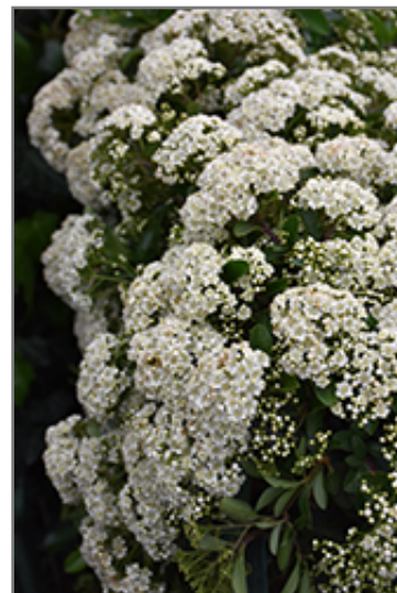
Mohave Firethorn flowers