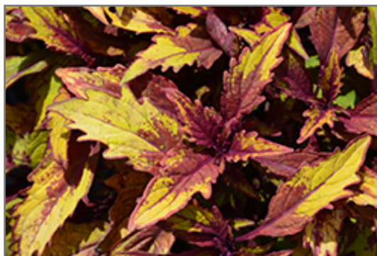
FlameThrower Spiced Curry Coleus foliage

FlameThrower Spiced Curry Coleus is recommended for the following landscape applications;