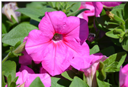
Easy Wave Pink Passion Petunia flowers

Easy Wave Pink Passion Petunia is recommended for the following landscape applications;