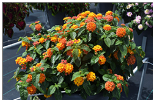
Lucky Flame Lantana in bloom

Lucky Flame Lantana will grow to be about 16 inches tall at maturity, with a spread of 14 inches. When grown in masses or used as a bedding plant, individual plants should be spaced approximately 12 inches apart. It has a low canopy. It grows at a fast rate, and under ideal conditions can be expected to live for approximately 20 years.