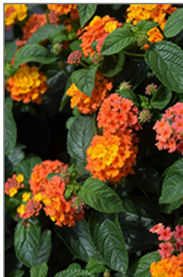
Lucky Flame Lantana flowers