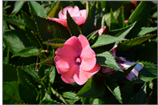
SunPatiens Spreading Shell Pink New Guinea Impatiens flowers

SunPatiens Spreading Shell Pink New Guinea Impatiens is recommended for the following landscape applications;