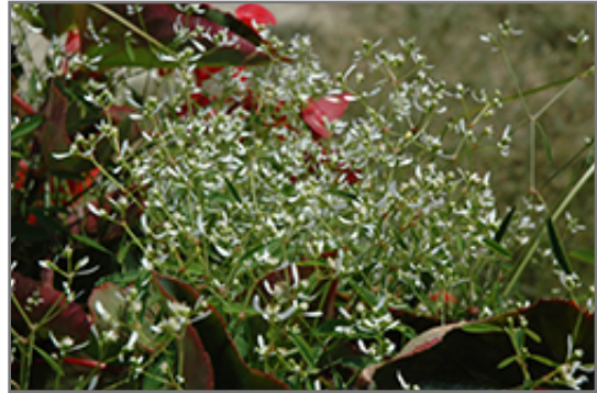
Glitz Euphorbia flowers

Glitz Euphorbia is a fine choice for the garden, but it is also a good selection for planting in outdoor containers and hanging baskets. It is often used as a 'filler' in the 'spiller-thriller-filler' container combination, providing a mass of flowers against which the thriller plants stand out. Note that when growing plants in outdoor containers and baskets, they may require more frequent waterings than they would in the yard or garden.