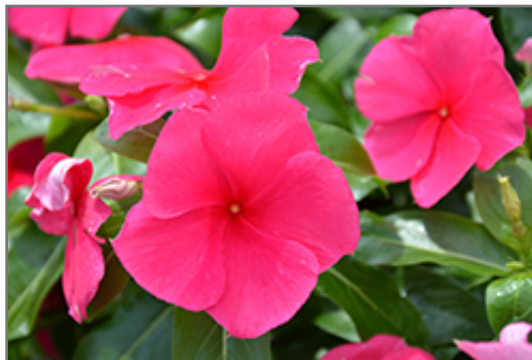
Valiant Punch Vinca flowers

Valiant Punch Vinca will grow to be about 12 inches tall at maturity, with a spread of 18 inches. Its foliage tends to remain dense right to the ground, not requiring facer plants in front. It grows at a fast rate, and under ideal conditions can be expected to live for approximately 5 years. As an evergreen perennial, this plant will typically keep its form and foliage year-round.