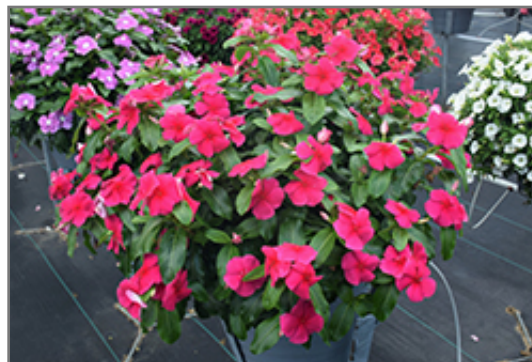
Valiant Punch Vinca in bloom