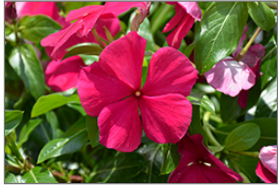
Valiant Burgundy Vinca flowers

Valiant Burgundy Vinca will grow to be about 12 inches tall at maturity, with a spread of 18 inches. Its foliage tends to remain dense right to the ground, not requiring facer plants in front. It grows at a fast rate, and under ideal conditions can be expected to live for approximately 5 years. As an evergreen perennial, this plant will typically keep its form and foliage year-round.