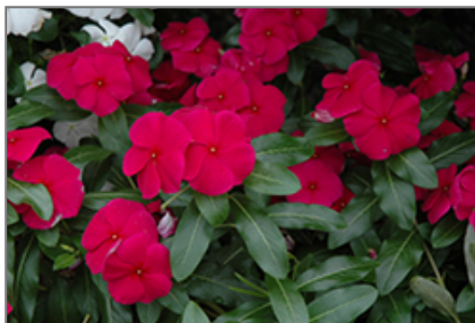
Valiant Burgundy Vinca flowers

This plant will require occasional maintenance and upkeep, and should not require much pruning, except when necessary, such as to remove dieback. It is a good choice for attracting butterflies to your yard, but is not particularly attractive to deer who tend to leave it alone in favor of tastier treats. It has no significant negative characteristics.