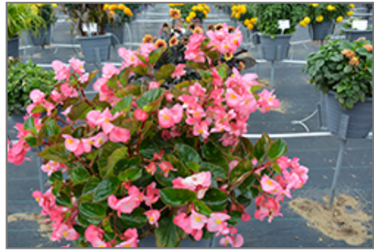
Big Pink Green Leaf Begonia in bloom

Big Pink Green Leaf Begonia is a fine choice for the garden, but it is also a good selection for planting in outdoor containers and hanging baskets. It is often used as a 'filler' in the 'spiller-thriller-filler' container combination, providing a mass of flowers and foliage against which the larger thriller plants stand out. Note that when growing plants in outdoor containers and baskets, they may require more frequent waterings than they would in the yard or garden.