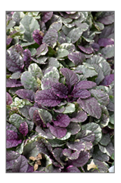
Burgundy Glow Bugleweed foliage