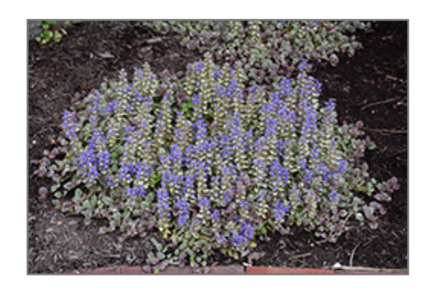
Burgundy Glow Bugleweed in bloom

Burgundy Glow Bugleweed is a fine choice for the garden, but it is also a good selection for planting in outdoor containers and hanging baskets. Because of its spreading habit of growth, it is ideally suited for use as a 'spiller' in the 'spiller-thriller-filler' container combination; plant it near the edges where it can spill gracefully over the pot. Note that when growing plants in outdoor containers and baskets, they may require more frequent waterings than they would in the yard or garden.