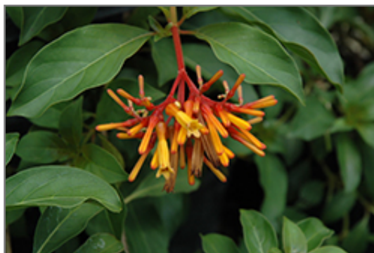
Dwarf Firebush flowers

Dwarf Firebush is recommended for the following landscape applications;