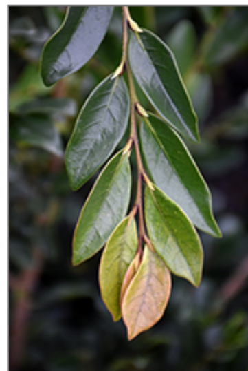
Linebacker Evergreen Distylium foliage

Linebacker Evergreen Distylium is recommended for the following landscape applications;