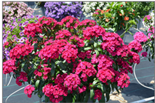
Jolt Cherry Hybrid Pinks in bloom