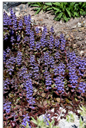
Mahogany Bugleweed flowers

Mahogany Bugleweed is a dense herbaceous evergreen perennial with a ground-hugging habit of growth. Its relatively fine texture sets it apart from other garden plants with less refined foliage.