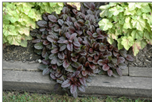
Mahogany Bugleweed