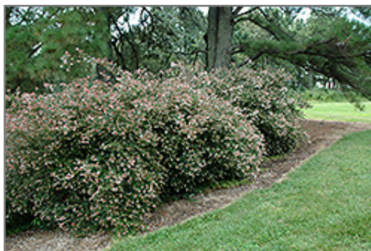
Glossy Abelia in bloom