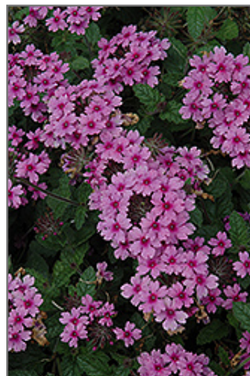
EnduraScape Lavender Verbena flowers

EnduraScape Lavender Verbena is recommended for the following landscape applications;