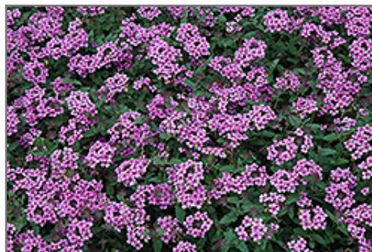
EnduraScape Lavender Verbena in bloom