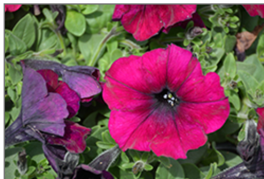
Easy Wave Burgundy Velour Petunia flowers