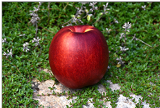
Fantasia Nectarine fruit

Fantasia Nectarine is draped in stunning clusters of fragrant pink flowers along the branches in early spring, which emerge from distinctive rose flower buds before the leaves. It has dark green deciduous foliage. The narrow leaves turn yellow in fall. The fruits are showy yellow drupes with cherry red overtones, which are carried in abundance in late summer. The fruit can be messy if allowed to drop on the lawn or walkways, and may require occasional clean-up.