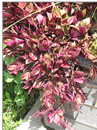
Purple Wandering Jew

Purple Wandering Jew is recommended for the following landscape applications;