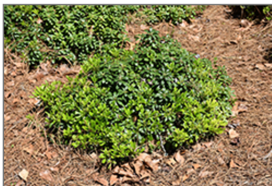
Wheeler's Dwarf Pittosporum