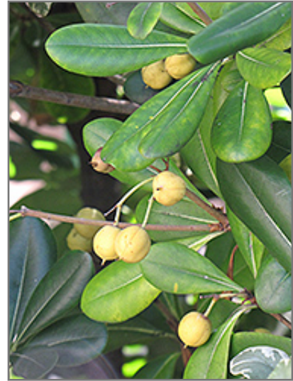
Wheeler's Dwarf Pittosporum fruit

This shrub does best in full sun to partial shade. It does best in average to evenly moist conditions, but will not tolerate standing water. It may require supplemental watering during periods of drought or extended heat. It is not particular as to soil type or pH. It is somewhat tolerant of urban pollution. This is a selected variety of a species not originally from North America.