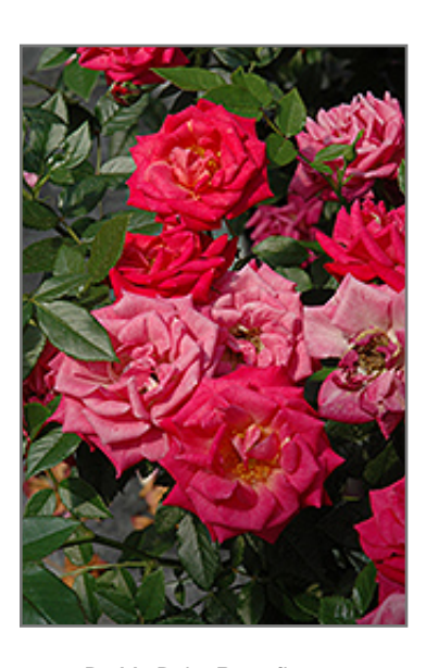
Be My Baby Rose flowers