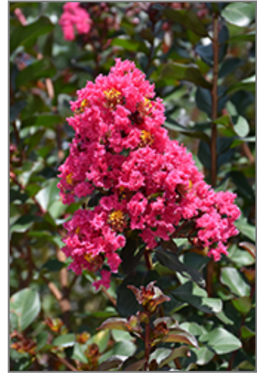
Pink Velour Crapemyrtle flowers