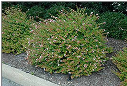
Rose Creek Abelia in bloom

Rose Creek Abelia is recommended for the following landscape applications;