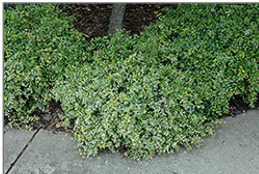
Hopley's Abelia

Hopley's Abelia is recommended for the following landscape applications;