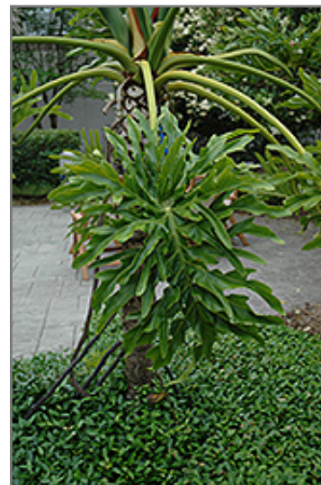
Tree Philodendron foliage