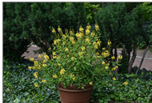
Thryallis in bloom