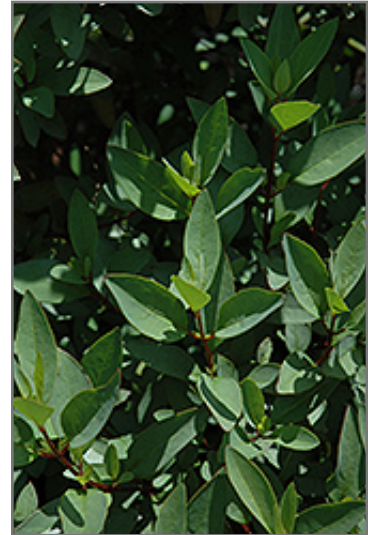
Thryallis foliage

This shrub does best in full sun to partial shade. It is very adaptable to both dry and moist growing conditions, but will not tolerate any standing water. It may require supplemental watering during periods of drought or extended heat. It is not particular as to soil pH, but grows best in sandy soils. It is somewhat tolerant of urban pollution. Consider applying a thick mulch around the root zone in winter to protect it in exposed locations or colder microclimates. This species is not originally from North America.