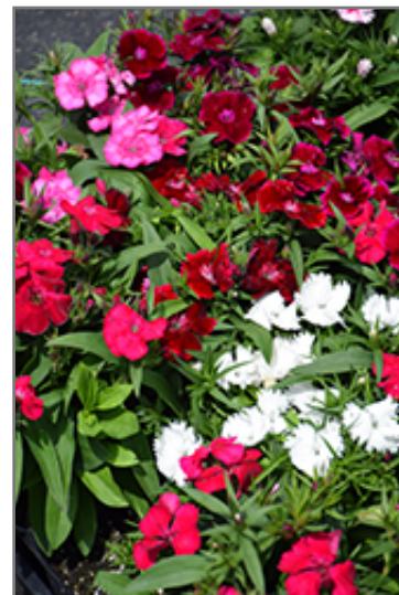
Floral Lace Mix Pinks flowers